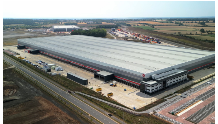
August 2025 Aerial of Plot 4, SEGRO Logistics Park Northampton

We will keep you updated on the status of the works via regular newsletters which will include details of our progress throughout. These newsletters will also be distributed to key stakeholders including local authorities, parish councils and local businesses by email. They will also be available on www.slp-northampton.com .