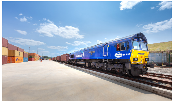
First Maritime train arriving at SEGRO Logistics Park Northampton