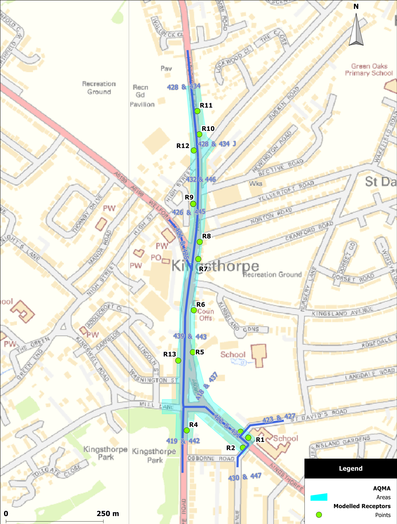
Figure 9.8: Local Operational Impacts - Northampton AQMA No.4, Kingsthorpe